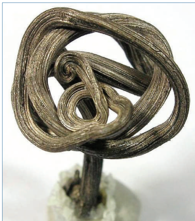
Fig. 2 - Native silver mineral from Kongsberg (Norway)

Use losses of the catalyst are small (2-3%) and depending on the operating conditions and poisons presence (e.g., iron in methanol must be lower than 0.005 ppm) the lifetime varies between a few mon-