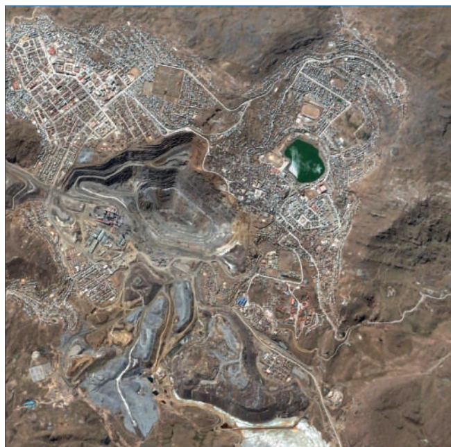
Fig. 3 - Aerial view of Cerro de Pasco city (Peru) with the open-pit mine ( http://cerropasco.blogspot.com/ )

The silver-containing base metal ores are initially crushed and concentrated by flotation methods to achieve mineral concentrations 30-40 times higher than natural occurrences. In this process, the hydrophobic sulphide particles adhere preferentially to a froth of oily bubbles that floats to the surface and is skimmed off. The specific methods for precious metal recovery are different for ores of copper, lead, zinc, and gold. As a by-product of copper, silver is separated with copper by smelting and then recovered as silver (so called doré due to a typical content of gold around 0.5-5%) in the anode slimes after electrolysis. As a by-product of lead or lead-zinc ores, silver is recovered with the lead bullion and removed by a liquid-liquid extraction with zinc added to a molten lead/silver mixture. Cyanide leaching can be used to recover both gold and silver from the respective ores. Silver metallurgy is complicated because of the relatively low concentrations in ores, the large number of minerals existing also within the same deposit