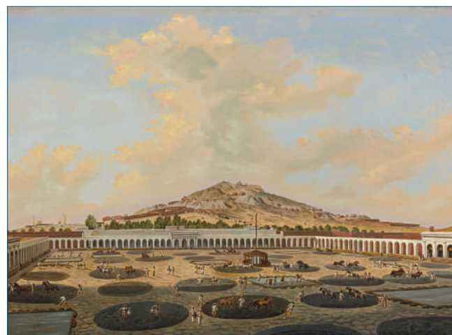
Fig. 4 - The Fresnillo complex (Mexico) in a painting dated 1846 by P. Gualdi. Silver ore amalgamation with mercury in the grey circles